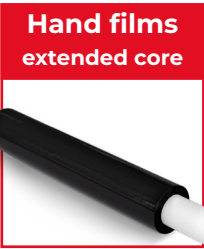
Hand films extended core